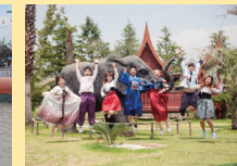
Korean Culture experience