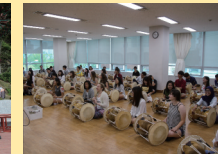
Traditional music performance